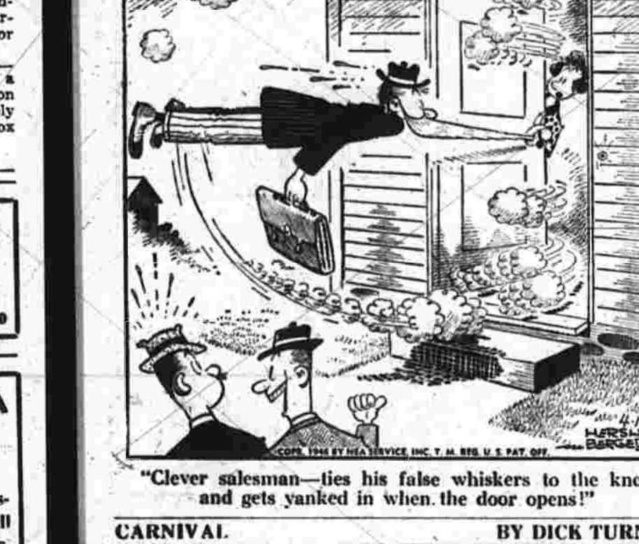
"Clever salesman—lies his false whiskers to the knob and gets yanked in when the door opens!"

Dr. Bancroft looked sharply at Ann through his glasses. "You've got to stop all this smoking and drinking. It's bad for you."