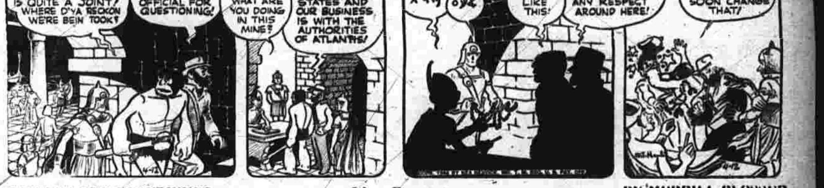
FRECKLES AND HIS FRIENDS